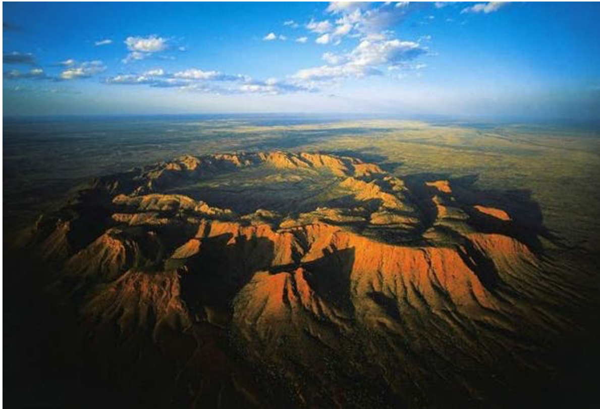
Tnorala (Gosses Bluff crater).

The place where the baby fell is a ring-shaped mountain range 5km wide and 150m high. The Arrernte people call it Tnorala . It is the remnant of a giant crater that formed 142 million years ago, when a comet or asteroid struck the Earth, driving the rocks upward.