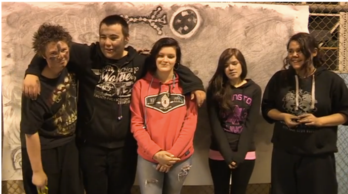
Students in Albury/Wodonga learning about Indigenous astronomy through the Charcoal Nights initiative.

Traditional fire practices are used across the country, bush medicines are being used to treat disease, and astronomical knowledge is revealing an intellectual complexity in Indigenous traditions that has gone largely unrecognised.