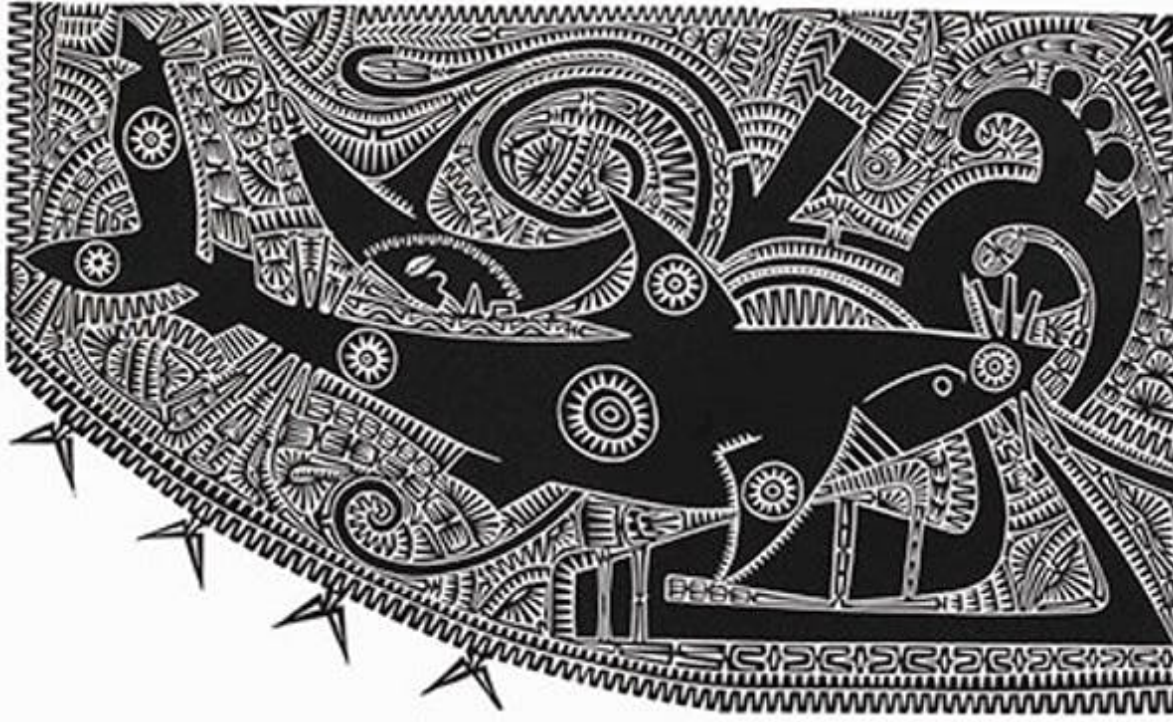
Torres Strait Islanders use constellations, such as the shark 'Baidam' pictured here, for practical purposes. Brian Robinson

and people should stay out of the water as it is very dangerous!